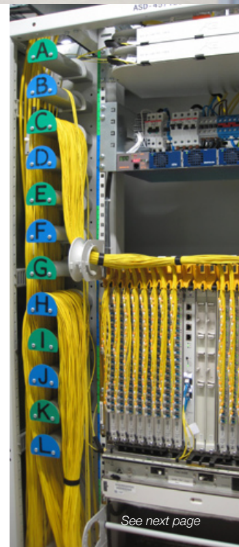
See next page